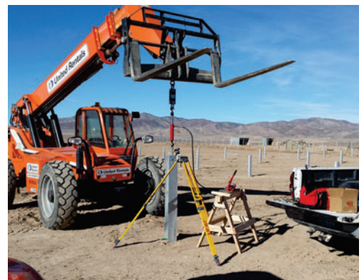
Hunter Solar (Utah)