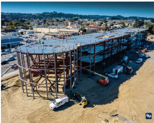
City of South San Francisco Civic Complex (California)