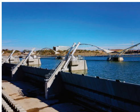
Tempe Town Lake Dam (Arizona)