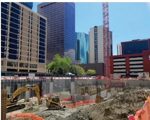
The Fitzgerald (Colorado)