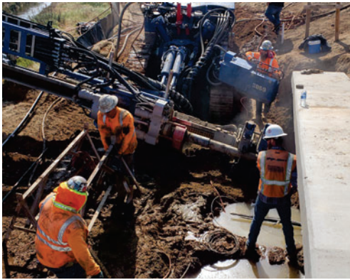
Port of San Diego Sweetwater Promenade (California)