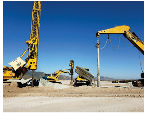
Fulfillment Warehouses (California, Arizona, Nevada)