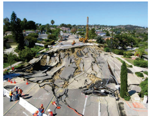
Mount Soledad Landslide (California)