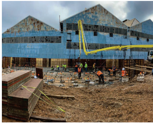
Port of Houston Clinton Terminal Concrete Silo Slip (Texas)